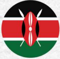
H.E. Ekitela Moru