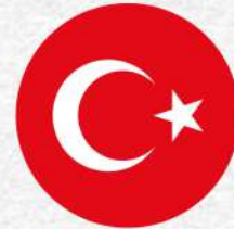
H.E. Emir Salim Yuksel, Hon. Fuat Oktay