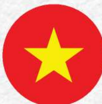
H.E. Nguyen Khac Dinh, H.E. Dinh Ngoc Linh, H.E. To Lam