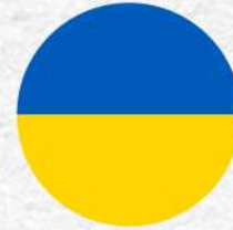
Hon. Lesia Vasylenko, Hon. Taras Kachla, Denys Mykhailiuk